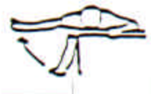
Prone Horizontal Abduction