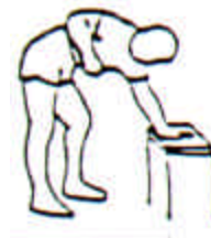
Bent Over Rows

Bent Over Rows: While bent over with back parallel to floor and arms hanging to floor, slowly pull arms up, bringing hands up to chest level. This motion is similar to using a cross-cut saw. Slowly lower arms to start and repeat as directed.